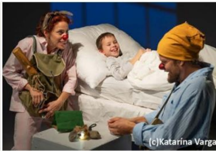
Cerveny Nos, Slovakia